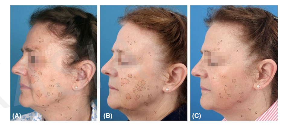
FIGURE 1 Standardized pictures obtained using a Visia camera system (Candfield); before the Kleresca® prepost treatment (A), 1 wk after the second Kleresca® session and immediately prior to the treatment with the QS-ruby laser (B), and 3 wk after the QS-ruby laser treatment (C) were used to track the changes in pigmentation. (D) Graph shows the % area of pigmentation identified from the patient pictures [Colour figure can be viewed at wileyonlinelibrary.com]

Here, we present a 67-year-old woman with histologically confirmed SL (Figure 1A) treated with the Kleresca<sup>®</sup> treatment (FB Dermatology, Ireland). Treatment comprised the application of a 2mm layer of the Kleresca<sup>®</sup> pre-post photoconverter gel followed by irradiation with a multi-LED lamp (447 nm), as per the instructions for use. A double/stacking treatment consisting of one 9-minute treatment session, a 10-minute interval, and a subsequent 9-minute treatment session was completed once a week for 2 weeks. One week after the second Kleresca<sup>®</sup> treatment session, the patient was treated with a 694 nm Qs-ruby laser using a 4-mm spot with