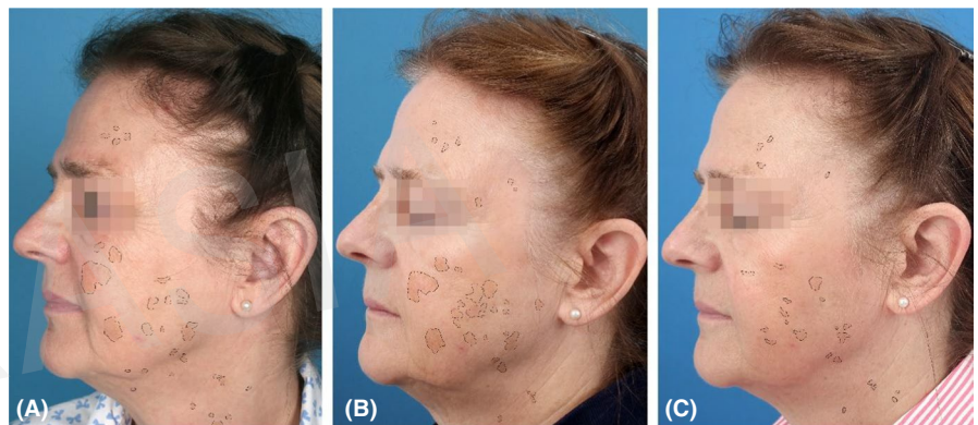
FIGURE 1 Standardized pictures obtained using a Visia camera system (Candfield); before the Kleresca® pre-post treatment (A), 1 wk after the second Kleresca® session and immediately prior to the treatment with the QS-ruby laser (B), and 3 wk after the QS-ruby laser treatment (C) were used to track the changes in pigmentation. (D) Graph shows the % area of pigmentation identified from the patient pictures [Colour figure can be viewed at wileyonlinelibrary.com ]

Here, we present a 67-year-old woman with histologically confirmed SL (Figure 1A) treated with the Kleresca® treatment (FB Dermatology, Ireland). Treatment comprised the application of a 2-mm layer of the Kleresca® pre-post photoconverter gel followed by irradiation with a multi-LED lamp (447 nm), as per the instructions for use. A double/stacking treatment consisting of one 9-minute treatment session, a 10-minute interval, and a subsequent 9-minute treatment session was completed once a week for 2 weeks. One week after the second Kleresca® treatment session, the patient was treated with a 694 nm Qs-ruby laser using a 4-mm spot with