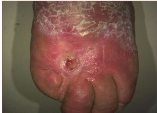
Figure 2. Week 12. Note the decrease in wound depth and the presence of granulation tissue.

“Management of DFUs is often complicated by poor diabetes control, recurrent infections, slow onset and altered patterns of wound closure, and repeated trauma to the wound.”