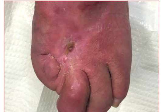
Figure 3. Wound closed, with epithelialization of wound base.

progression of the ulceration in a non-surgical candidate. The patient was compliant with all visits and there was no relapse in his alcohol consumption.