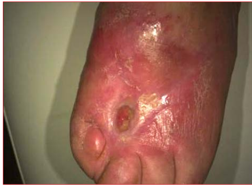
Figure 1. Initial evaluation. Note previous amputation of great toe secondary to osteomyelitis.

We present the case of a 68-year-old male with a 10-year history of type 2 diabetes as well as a significant history of previous alcohol consumption. The